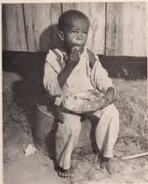
THIS LAD , son of a migrant worker, eats with his fingers since utensils are scarce

How can the spirit of Home Missions, which once carried the ministries of the Church to the far places of the nation and led in the conquest and ordering of a continent, be expressed in terms that are most appropriate to the needs of our generation? What are the new frontiers of our society, where the most vital forces of American life are now shaping the future, and how are they to be occupied by the Church? How can the message of the Christian gospel be communicated to a generation that is largely unfamiliar with the Bible and the classical Christian heritage? In what ways can the Church penetrate redemptively into a society that has become highly secularized and is in peril of breaking connection with the religious sources of its best purposes and hopes? What is the role of the Church in the struggle